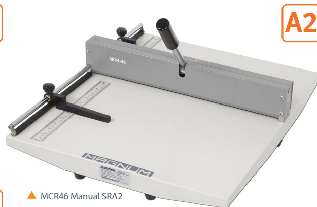
▲ MCR46 Manual SRA2