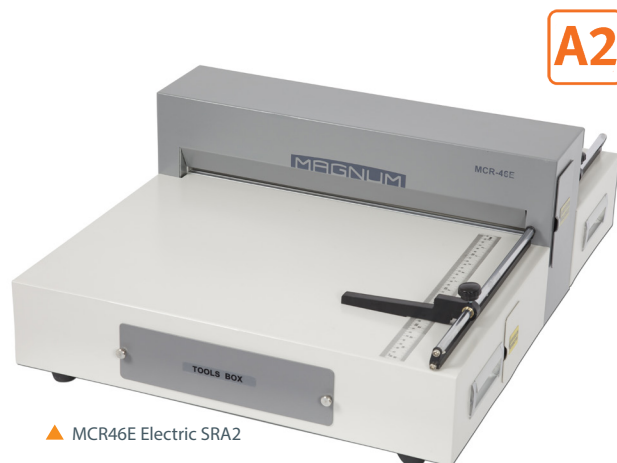
▲ MCR46E Electric SRA2