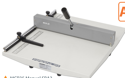
▲ MCR35 Manual SRA3