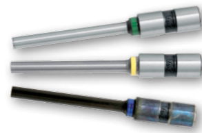
NAGEL drill bits are available in different types (alternative drill bits on p.8)