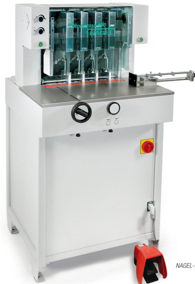
NAGEL-Citoborma 490 Vario