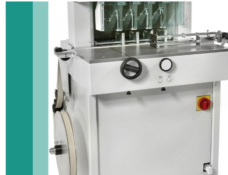
Manual indexing drill matrix ( cardboard )