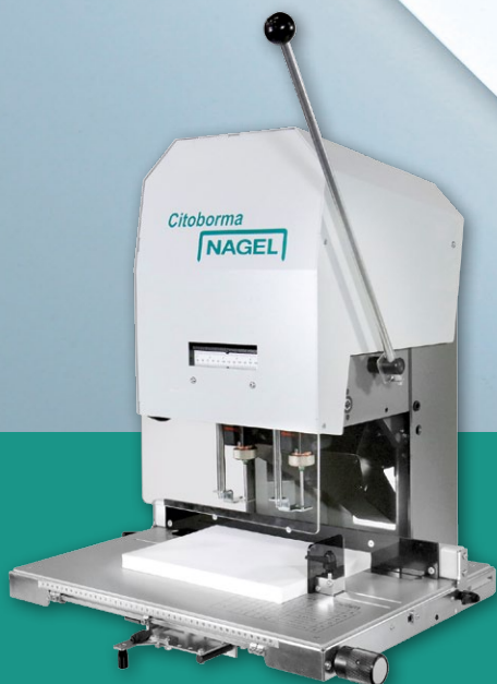
NAGEL-Citoborma 290 B table top