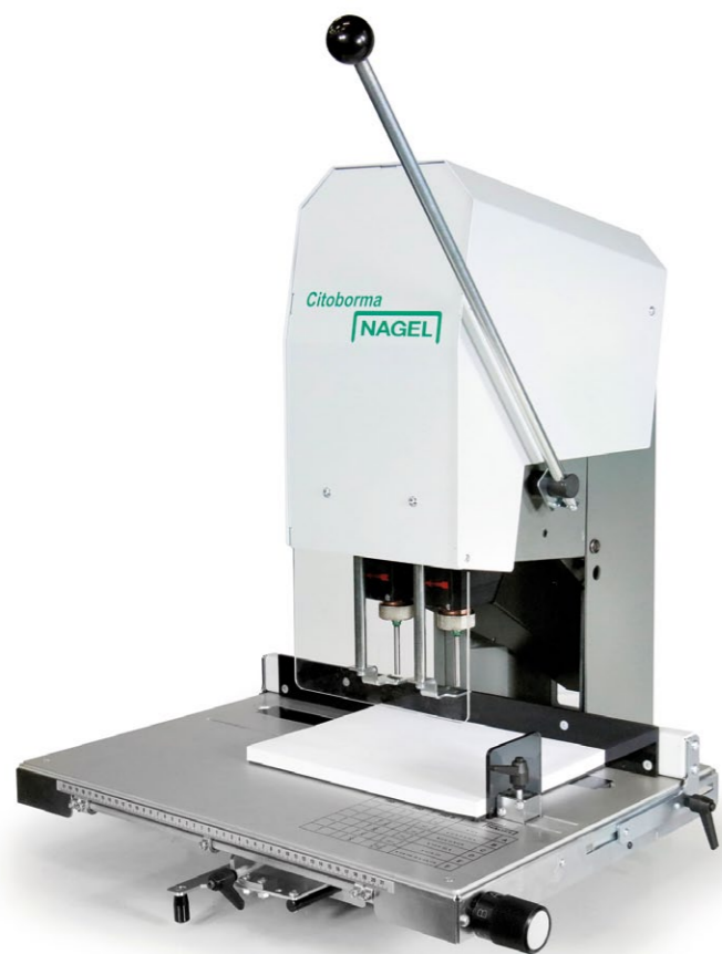
NAGEL-Citoborma 190 table top

Nagel offers three different versions of the Citoborma 290: