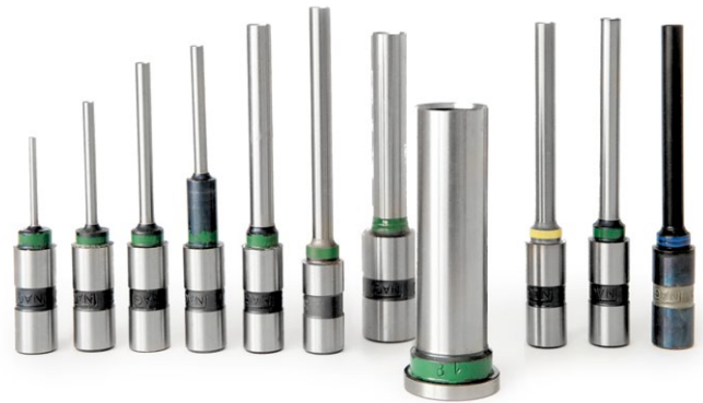
Nagel paper drill bits: 2 – 35 mm diameter, 30 – 60 mm working length, and special designs on request