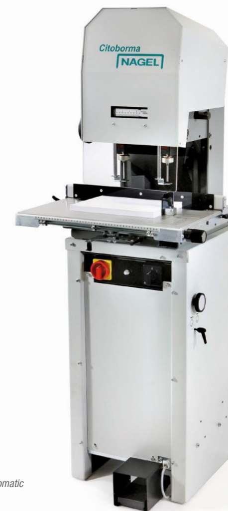
NAGEL-Citoborma 290 AB with an automatic lifting gear and stand

The Nagel Citoborma 190/290 series enable users to work efficiently and highly precisely.