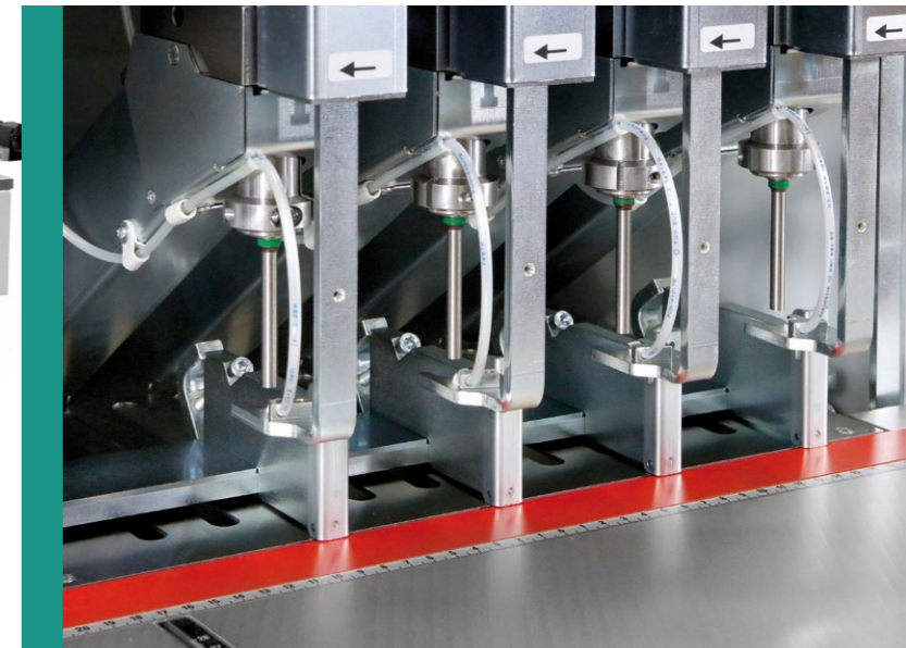
Professional drill bit lubrication with cooling system