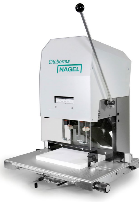
NAGEL-Citoborma 290 B table top